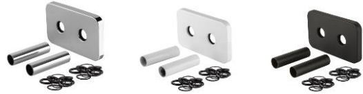
TA BB - RAL 9016 NN - RAL 9004