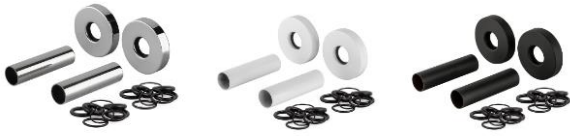
TA BB - RAL 9016 NN - RAL 9004

Art. 062 : Kit copritubo int. 50 mm. Pipe cover set with 50 mm center distance.