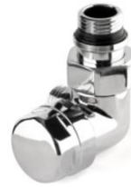
130TA-D (destra - rechts - right)

Temperatura di esercizio Betriebstemperatur -20°C+110°C Working temperature