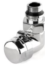
130TA-D (destra - rechts - right)

Temperatura di esercizio Betriebstemperatur -20°C+110°C Working temperature