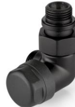
130NN-D (destra - rechts - right)