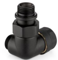
130NN-S (sinistra - links - left)