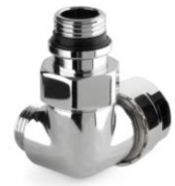
130TA-S (sinistra - links - left)