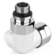
130TB-S (sinistra - links - left)