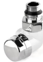
130TB-D (destra - rechts - right)