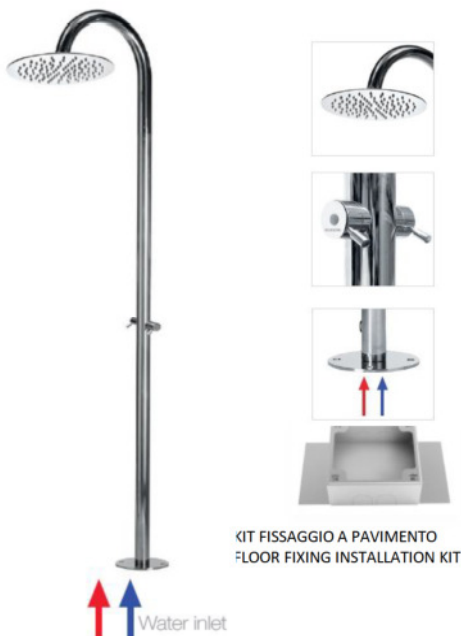
Immagine Prodotto - Product Image

Душевая колонна TETIS из стали INOX AISI 316, Душевая колонна укомплектована: Комплект для крепления к полу и подключению к водоснабжению (горячему и холодному), 2 Прогрессивных смесителя, Душ TETIS диам. Ø250 мм