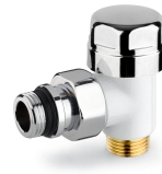
100TB - RAL 9016