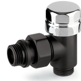
100NN - RAL 9004